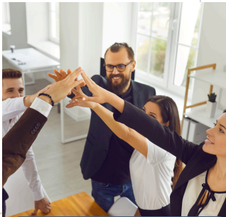
Executive & Leadership Coaching