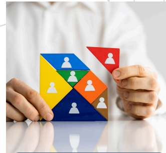
HR Development & Consulting